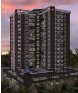
1 st Place : Asset Majestic Thrissur