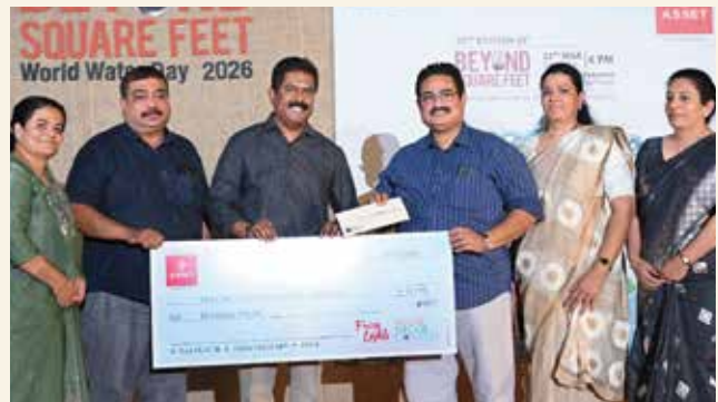
Skyline Avenue Suites, Thrissur