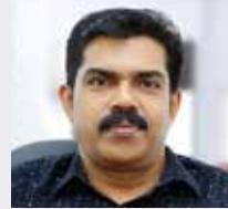
G Venu Internal Auditor