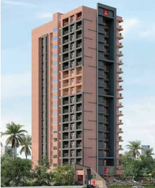
Asset Serenity - Kottayam