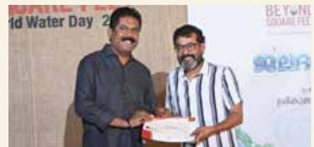
Kent Oak Ville, Kochi