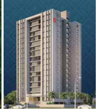
First Runner Up : Asset TKM Malhar Kollam