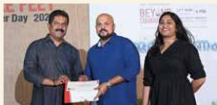
Lotus Palakkattil Habitat, Kochi