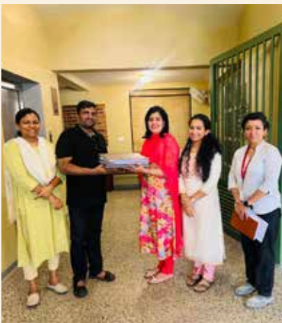
Asset Radiance Handed Over to Owners Association