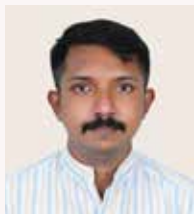
Sankar S Projects - Trivandrum