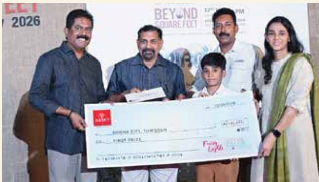
Sobha City, Thrissur