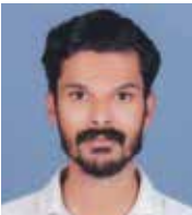
Vishnu T P Projects - Kochi