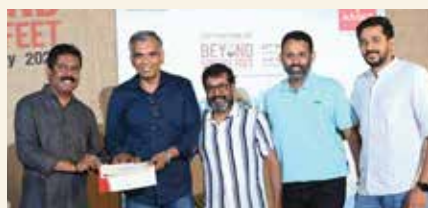
Asset Alpine Oaks, Kochi