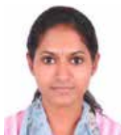
Mary Stephy Projects - Kochi