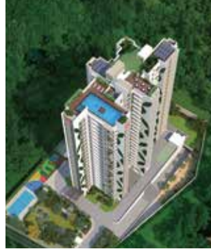
1 st Place : Asset Leaf Trivandrum