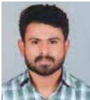
Lakshmanan A Projects - Kochi