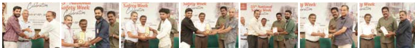
Best Safety Initiative Photography – Asset Samskriti