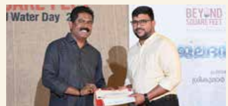
Windbrook Place, Trivandrum