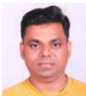
Sukheesh Surendran Projects - Thrissur