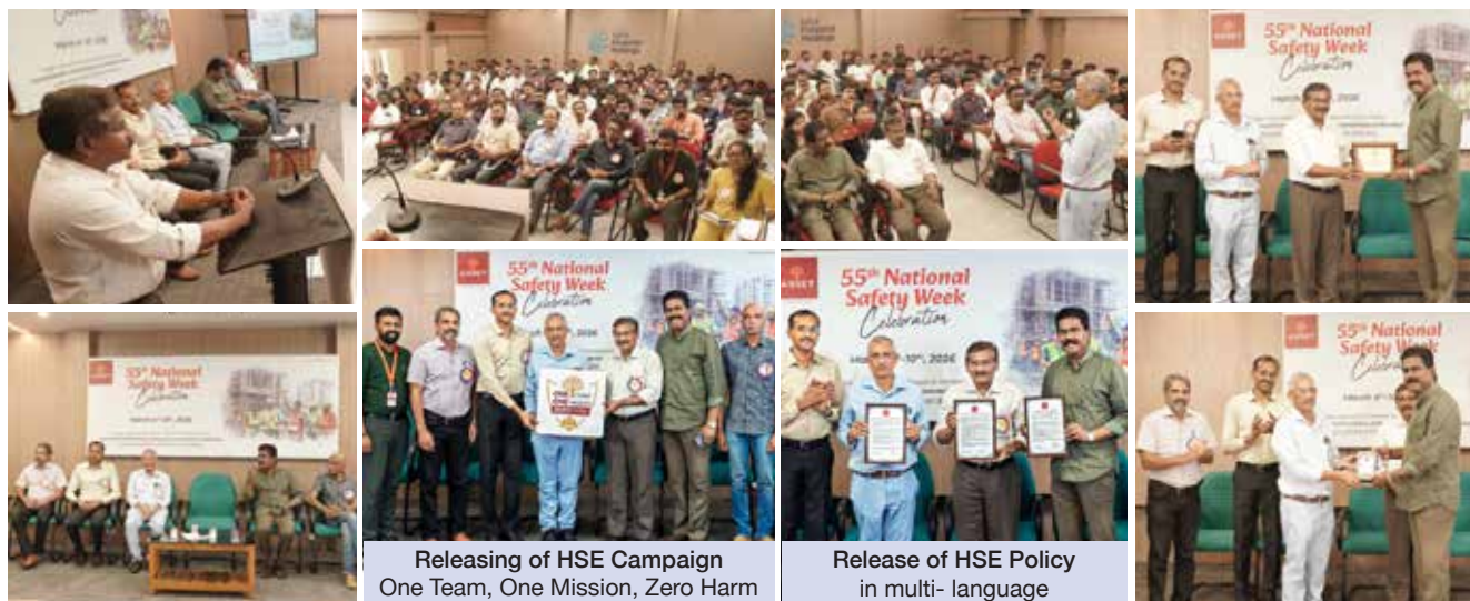
Releasing of HSE Campaign One Team, One Mission, Zero Harm

The campaign is being implemented across 33+ project sites with safety awareness and training programs. As part of the program, awards were distributed to last year’s best performers as well as to the winners of the Safety Week competitions conducted over the past week.