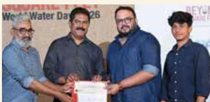
Nanma Fenix Apartments, Kochi