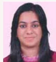
Arathy K S Customization - Kochi