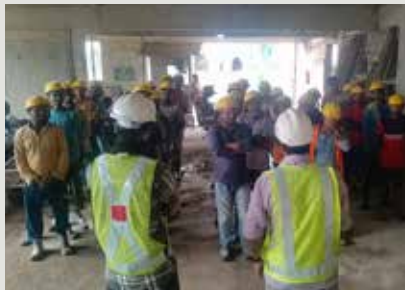
Asset Sovereign - Trivandrum