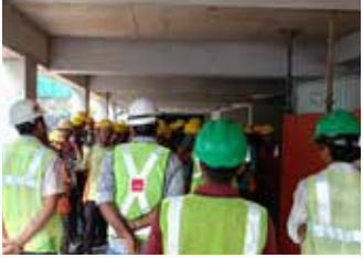
Asset Canzara - Trivandrum