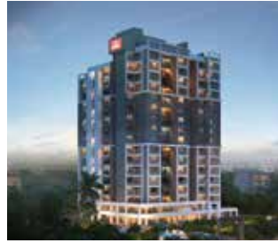
1 st - Asset Sreyas Ernakulam