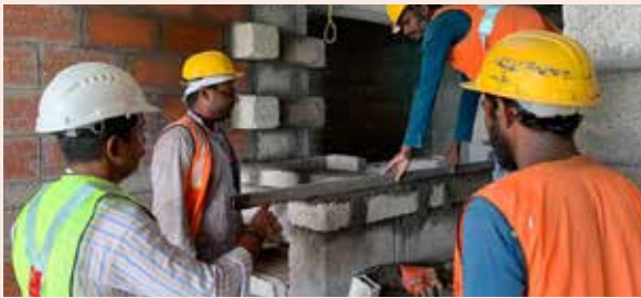
Asset Sovereign - Trivandrum