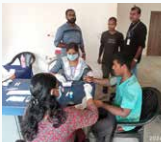
Asset Celeste - Kottayam