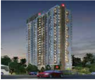
1 st - Asset Canzara Trivandrum