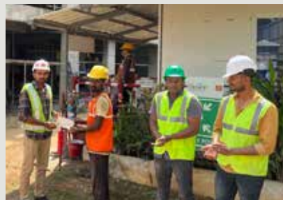
Asset Winside - Thrissur