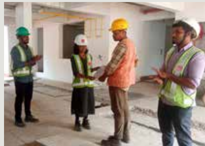
Asset Celeste - Kottayam