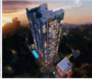
1 st Runner-up Asset PKS Heritage - Calicut