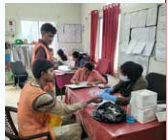
Asset Majestic - Thrissur