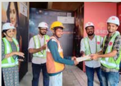
Asset Majestic - Thrissur