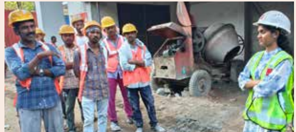
Asset Moon Grace - Ernakulam