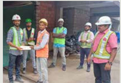
Asset Chamber - Kannur