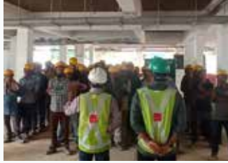
Asset Celeste- Kottayam