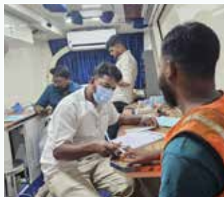
Asset Winside - Thrissur