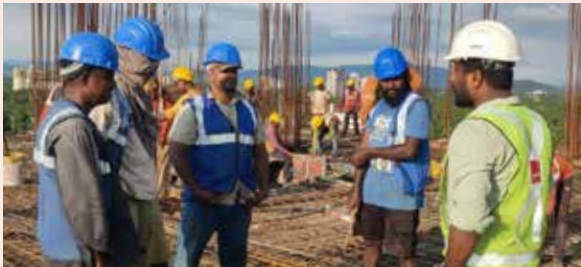
Asset Majestic - Ernakulam