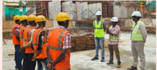
Asset Zenith - Calicut