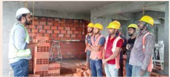
Asset Dominion - Ernakulam