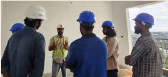
Asset Heritage - Calicut