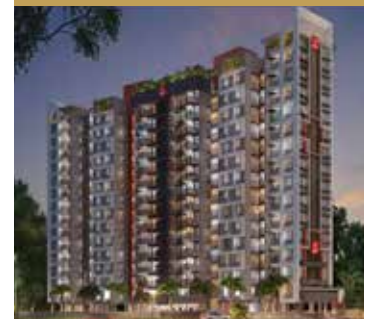
Asset Chamber - Kannur