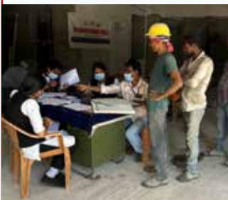
Asset Sovereign - Trivandrum