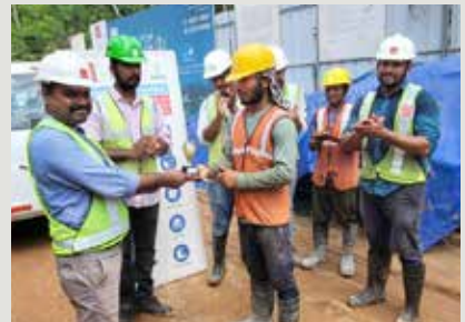
Asset Nilaavu - Alappuzha