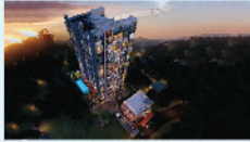
1st-Asset PKS Heritage