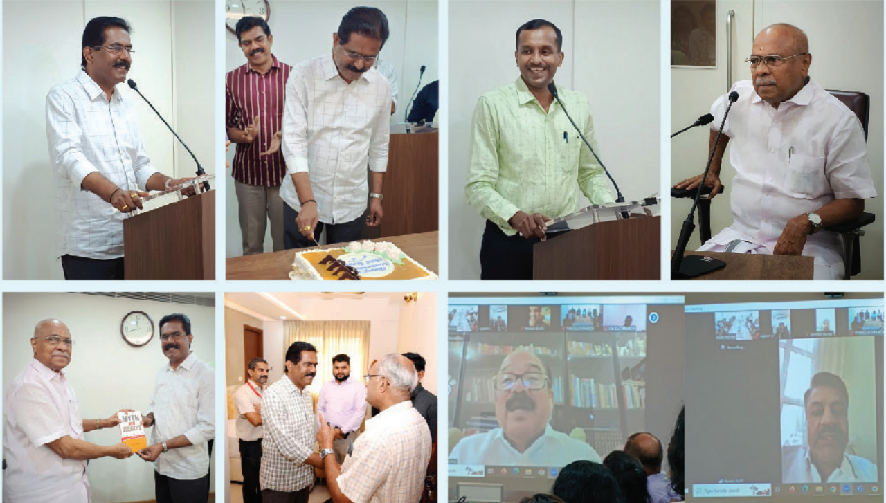
Snapshots from the celebration.

Asset Homes celebrated its successful and incredible journey of 17 years on 19 th November 2023.