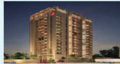
1st Runner up Asset Dominion