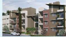
1st Runner-up Asset Down to Earth