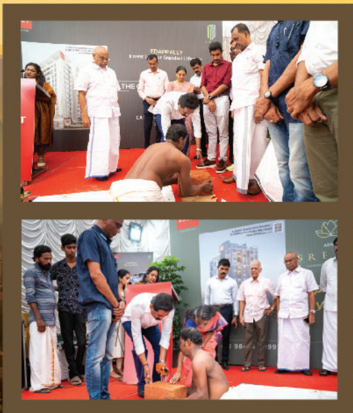
Asset The Grand Entry & Asset Sreyas Launched

Asset Homes celebrates 17 th Anniversary