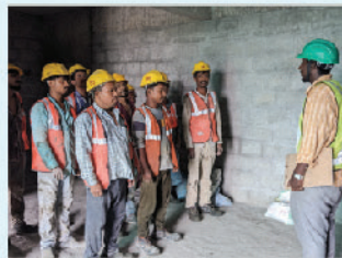
Asset Alpine Maple