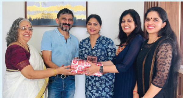
Asset Delight Brand Ambassador Ms. Asha Sharath, Asset Rangoli