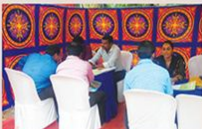
Asset Homes Stall at the Versatile project site.