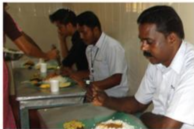
Charity Day: Asset Homes observed Charity Day on 21 st May by spending time with the children of Sree Narayana Samajam, Aluva.