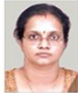
Resmi C 7 th February