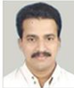
K K Tomy 3 rd February