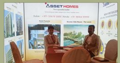
Asset Homes stall at the real estate exhibition held in Dubai.