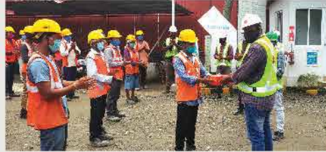
Safety Day celebrations were held at Asset Rangoli