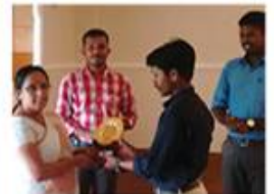
Best site for safety practice-out station Asset Chiraag