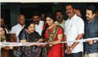
Playback Singer Dr. K. S. Chithra and Dancer & Actor Asha Sarath inaugurates the 40 th completed project of Asset Homes - Asset Lineage at Sasthamangalam, Thiruvananthapuram.