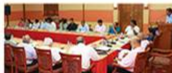
Route Map to the Future: In our incessant quest to reach greater heights with superior corporate governance and to prepare ourselves for the hurdles that lie ahead of us in the coming year, we have conducted the budget meeting for the FY 2016-17 with our Advisory Board Members.