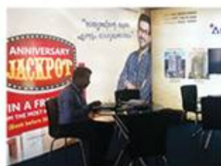
Manorama Parpidam Expo in progress at Thrissur