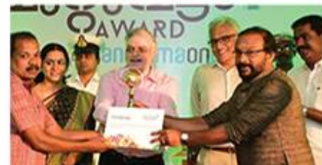
Special Jury Award: Thanal Residence Association, Thrissur