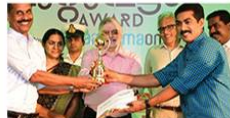
Second: Gandhipura Residence Association, Trivandrum

The Chuttuvattom Award for Best Residents Association in Kerala instituted by Manorama Online in association with Asset Homes was won by Netaji Nagar Residents' Association (Niravu), Vengery, Kozhikode. Kerala Governor Justice P. Sathasivam gave away the awards at a grand function. The glimpses from the event are given below.