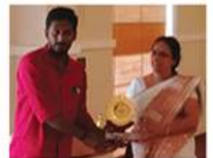
Best site for safety practice Asset - Castle