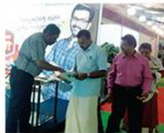
Manorama Parpidam Expo in progress at Kollam