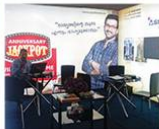
Manorama Parpidam Expo in progress at Palakkad