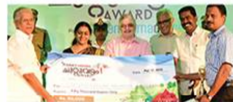
Third: Shanthi Nagar Residence Association, Kollam